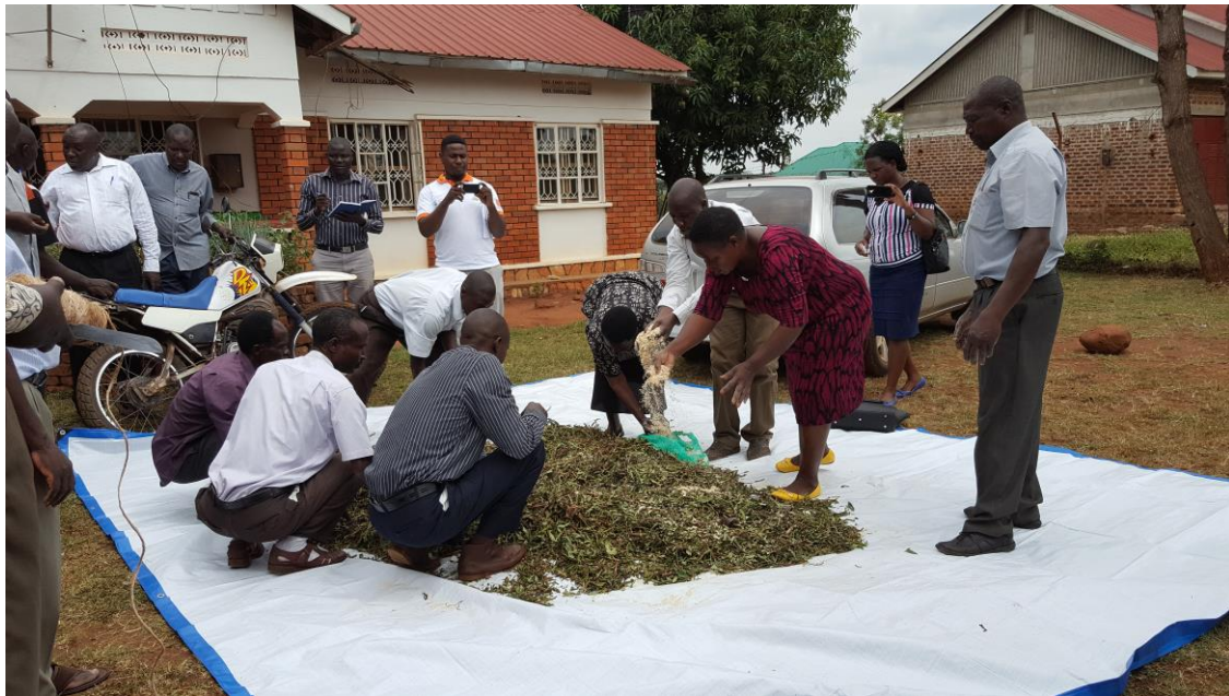
Mixing chopped sweetpotato vines with maize bran