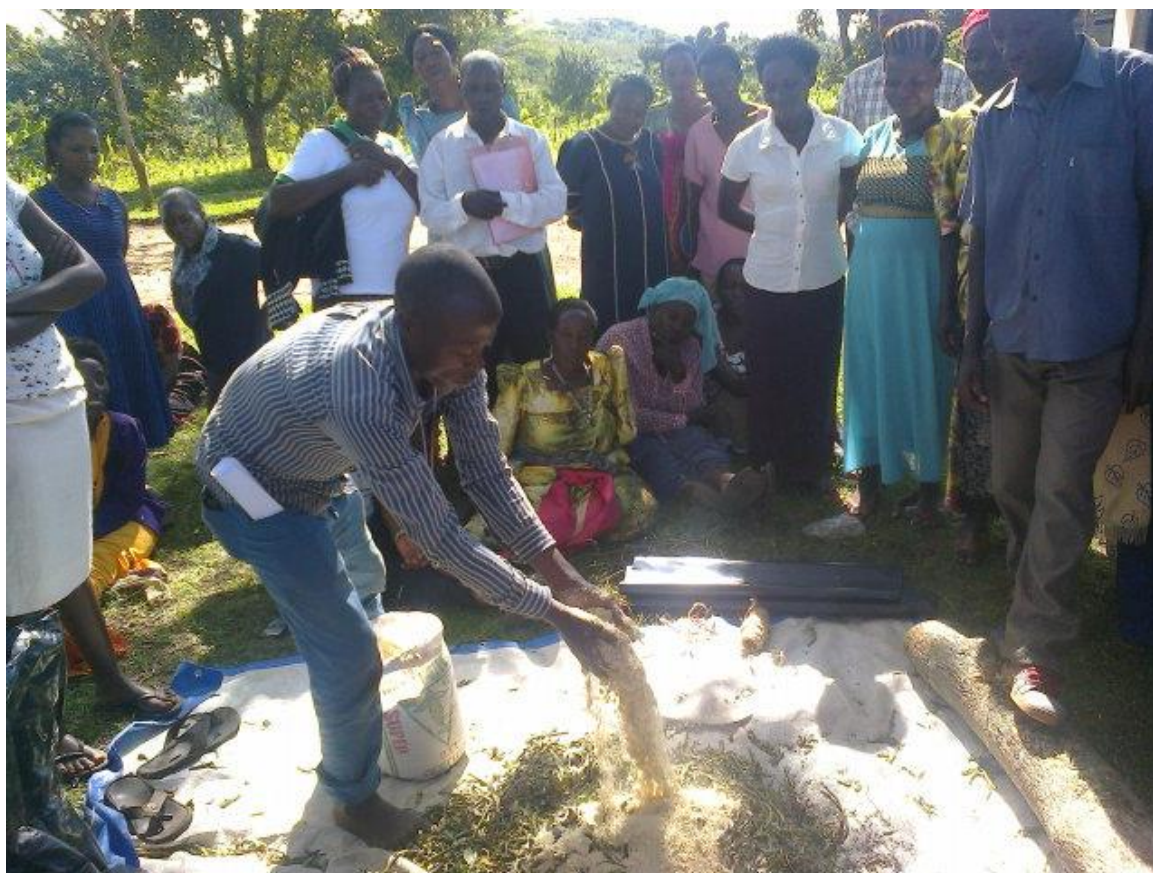
Demonstration in Buwunga sub-county, Masaka district

The Bavubuka Tweekembe Group demonstrated silage making using the polythene tube technology.