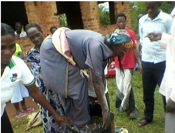
Compaction of vines in a silo bag