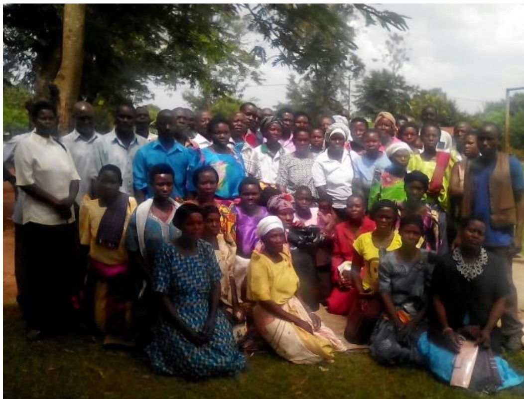
Participants from Bugulubya sub-county, Kamuli district