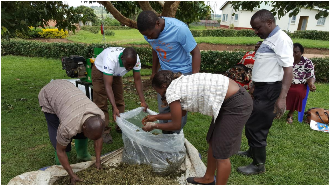
Participants fill the plastic tube silo with a mixture of chopped sweetpotato vines and maize bran