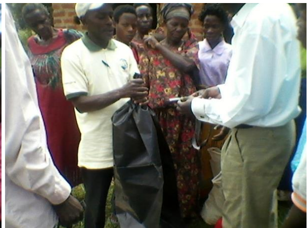
How to make a silo bag