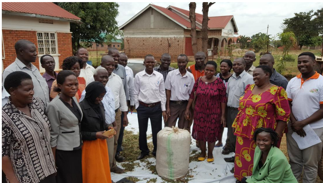
Participants to the TOT workshop at VEDCO offices, Kamuli

The ToT workshop was conducted at VEDCO premises on 13 th December 2016. The farmer workshops were conducted at Kiwungu Baptist Church, Butansi sub-county and at Bukyonza Primary School, Bukyonza village, Bugulumbya sub-county on 14 th and 15 th December 2016, respectively. The workshops were organized and conducted by the International Potato Centre (CIP), VEDCO, International Livestock Research Institute (ILRI), National Livestock Resources Research Institute (NaLIRRI), Bavubuka Twekembe group.