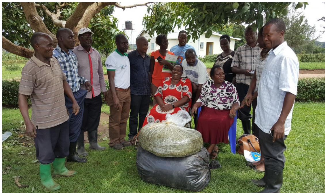
Participants to the TOT workshop at Kamenyamiggo-ZARDI

The ToT workshop was conducted at Kamenyamiggo-ZARDI on 29 th November 2016. The farmer workshops were conducted at St. Paul Primary School, Kitovu, Senyange sub-county on 30 th November 2016 and at Buwunga Sub-county headquarters, Buwunga sub-county on 1 st November 2016. The workshop was organized by the International Potato Centre (CIP), International Livestock Research Institute (ILRI), and National Livestock Resources Research Institute (NALIRRI), Bavubuka Tweekembe group, CHAIN UGANDA and Masaka local government.