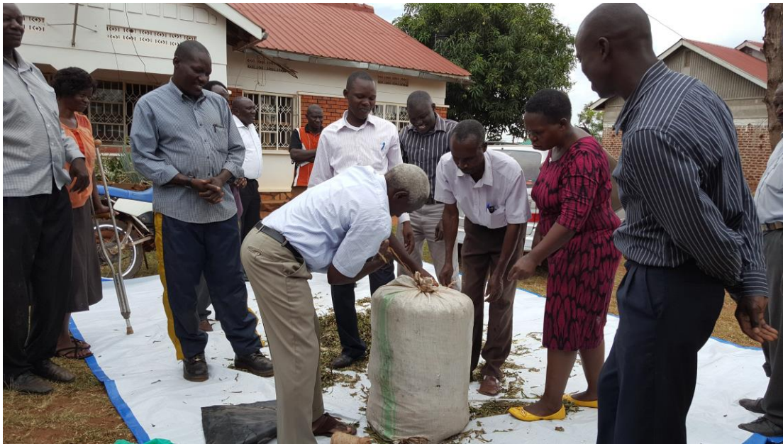
An extension staff in Kamuli district fills the plastic tube silo with a mixture of chopped sweetpotato vines and maize bran