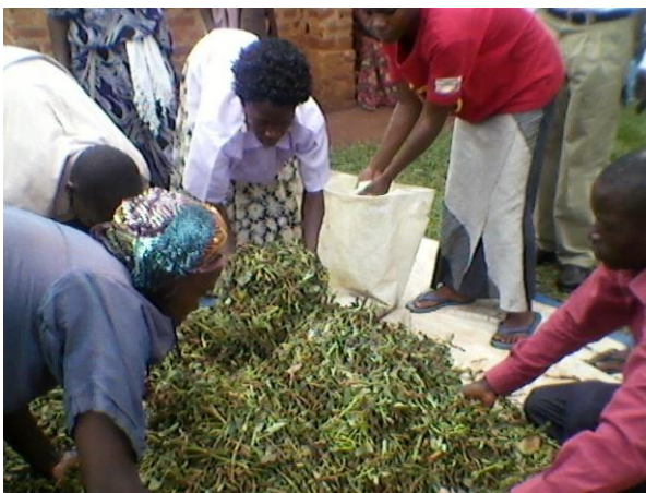
Adding additive (maize bran) to chopped vines