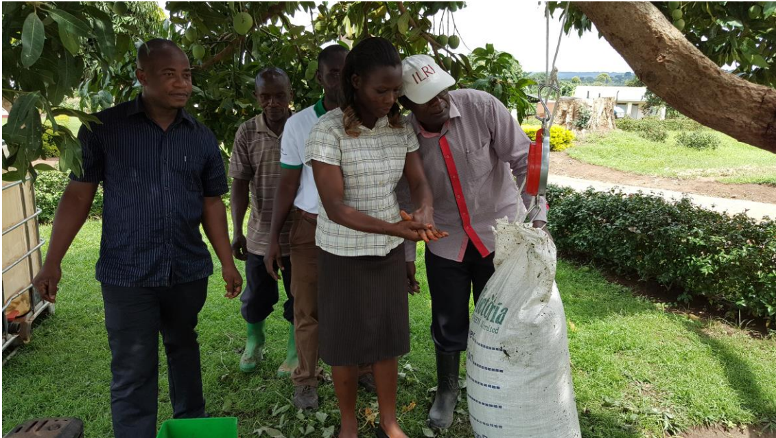
Weighing maize bran