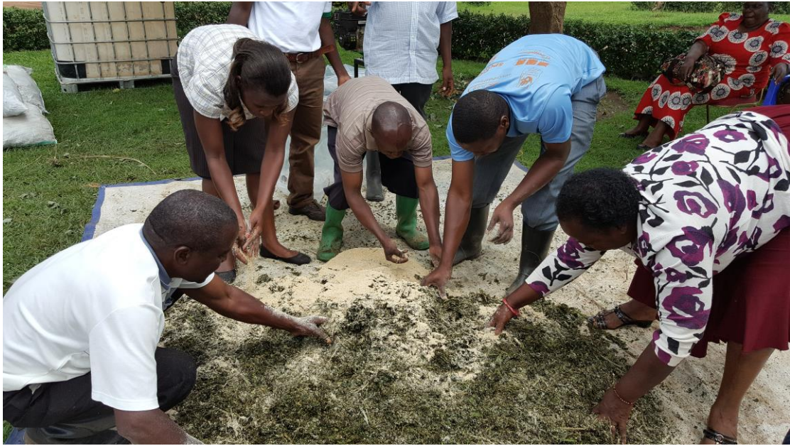
Mixing chopped sweetpotato vines with maize bran