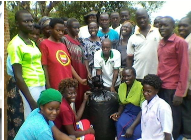
Ensilaged sweet potato vines