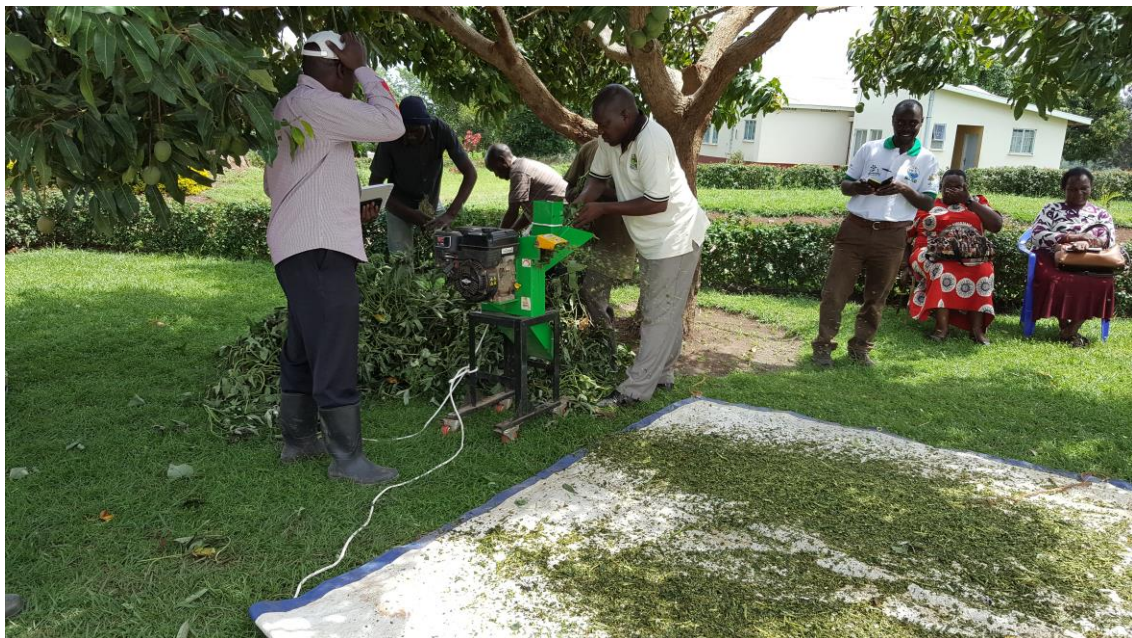
Chopping sweetpotato vines

The participants were involved in practical silage making conducted by the youth group members as shown in the pictures below.