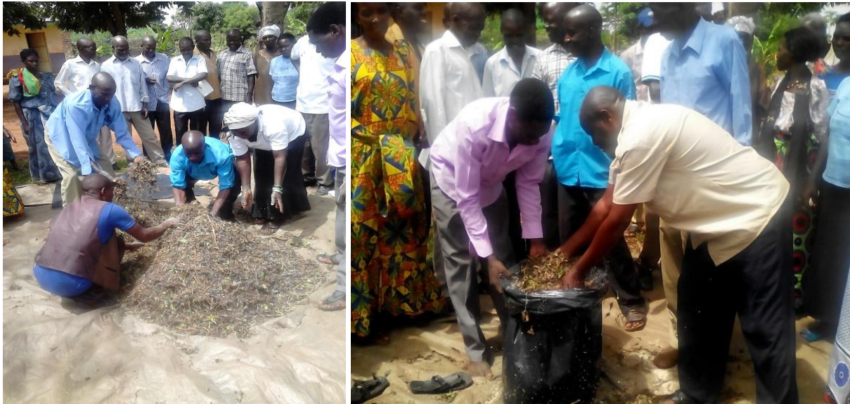
Demonstration in Bugulumba sub-county, Kamuli district